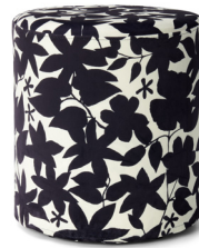
IMARA ANTHRACITE pouf