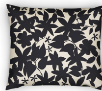
IMARA ANTHRACITE cushion