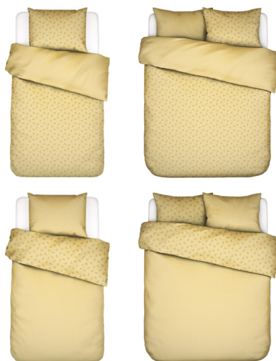
LILY MELODY LEMON YELLOW

NL 1p set 140x220 + 60x70 €69,95 2p set 200x220 + 2/60x70 €129,95 2p set 240x220 + 2/60x70 €139,95 60x70 cm €19,95 DE 1p set 135x200 + 80x80 €69,95 1p set 155x220 + 80x80 €89,95 AT 1p set 140x200 + 70x90 €69,95