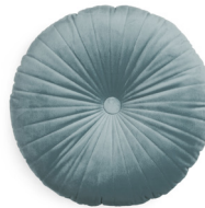
NAINA DENIM cushion