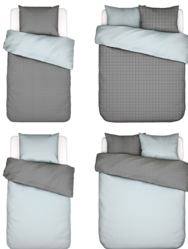
PIED DE COOL BLACK

NL 1p set 140x220 + 60x70 €69,95 2p set 200x220 + 2/60x70 €129,95 2p set 240x220 + 2/60x70 €139,95 60x70 cm €19,95 DE 1p set 135x200 + 80x80 €69,95 1p set 155x220 + 80x80 €89,95 AT 1p set 140x200 + 70x90 €69,95