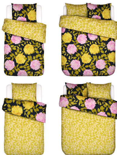
BLOOM WITH A VIEW BLACK

NL 1p set 140x220 + 60x70 €69,95 2p set 200x220 + 2/60x70 €129,95 2p set 240x220 + 2/60x70 €139,95 60x70 cm €19,95 DE 1p set 135x200 + 80x80 €69,95 1p set 155x220 + 80x80 €89,95 AT 1p set 140x200 + 70x90 €69,95