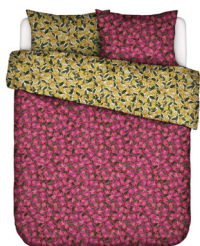
BELLFLOWER BEAUTY ROSE VIOLET duvet cover