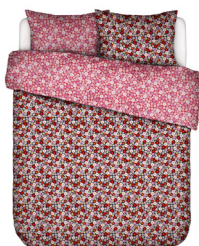
MELLOW MILLESFLEURS BLACK duvet cover