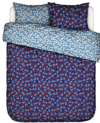
BLOOMING BALLET MARINE BLUE duvet cover