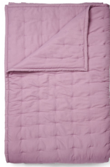
RUTH GRAPE plaid/quilt