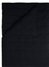
RUTH ANTHRACITE plaid/quilt