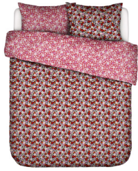
MELLOW MILLESFLEURS BLACK duvet cover