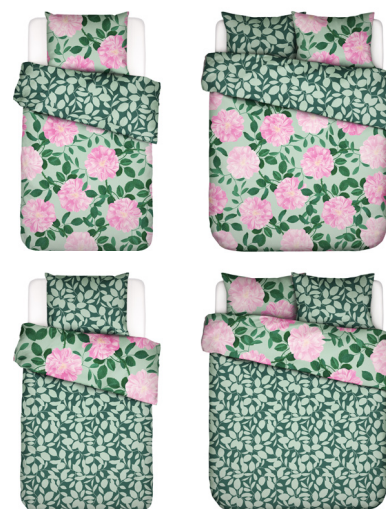
BLOOM WITH A VIEW MISTY GREEN

NL 1p set 140x220 + 60x70 €69,95 2p set 200x220 + 2/60x70 €129,95 2p set 240x220 + 2/60x70 €139,95 60x70 cm €19,95 DE 1p set 135x200 + 80x80 €69,95 1p set 155x220 + 80x80 €89,95 AT 1p set 140x200 + 70x90 €69,95