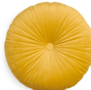
NAINA MUSTARD cushion