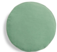
MADS VERDANT GREEN cushion