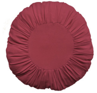
GIGI CHERRY PINK cushion