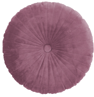
NAINA DUSTY LILAC cushion