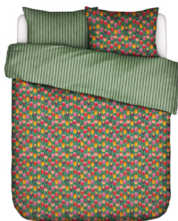
TULIP FIELD GRASS GREEN duvet cover