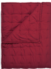
RUTH WINE RED plaid/quilt