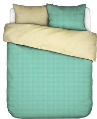
PIED DE COOL SIMPLY GREEN duvet cover