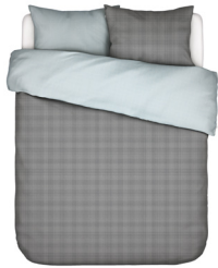
PIED DE COOL BLACK duvet cover