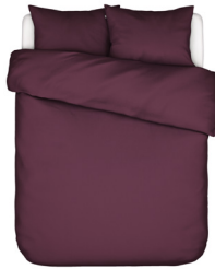
MINTE BURGUNDY duvet cover