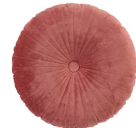
NAINA CANYON ROSE cushion