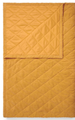
BILLIE MUSTARD plaid/quilt