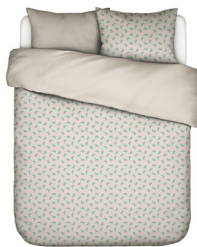
LILY MELODY TOFU TAUPE duvet cover