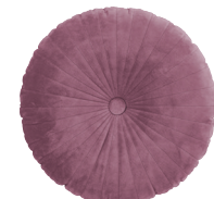
NAINA DUSTY LILAC cushion