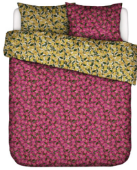
BELLFLOWER BEAUTY ROSE VIOLET duvet cover