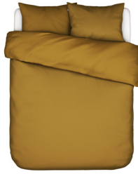
MINTE OLIVE duvet cover