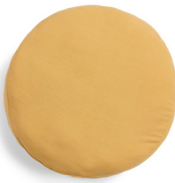
MADS OCHRE cushion