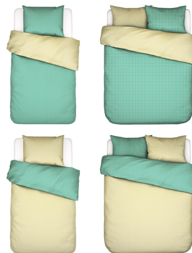
PIED DE COOL SIMPLY GREEN

NL 1p set 140x220 + 60x70 €69,95 2p set 200x220 + 2/60x70 €129,95 2p set 240x220 + 2/60x70 €139,95 60x70 cm €19,95 DE 1p set 135x200 + 80x80 €69,95