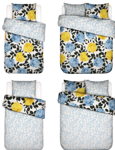
BLOOM WITH A VIEW BRIGHT WHITE

NL 1p set 140x220 + 60x70 €69,95 2p set 200x220 + 2/60x70 €129,95 2p set 240x220 + 2/60x70 €139,95 60x70 cm €19,95 DE 1p set 135x200 + 80x80 €69,95 1p set 155x220 + 80x80 €89,95 AT 1p set 140x200 + 70x90 €69,95