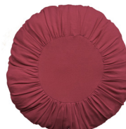
GIGI CHERRY PINK cushion