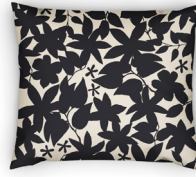
IMARA ANTHRACITE cushion