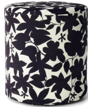
IMARA ANTHRACITE pouf