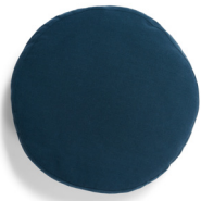
MADS DARK TEAL cushion